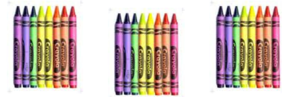
2011-2012 School Year